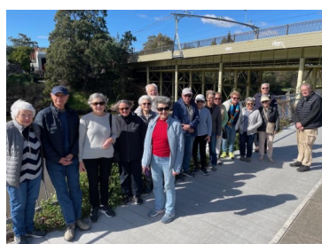
Walking Group 21 August