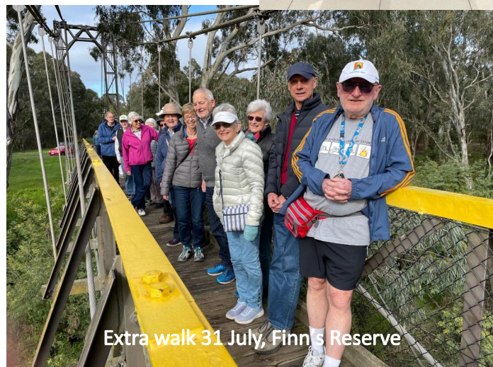
Extra walk 31 July, Finn's Reserve