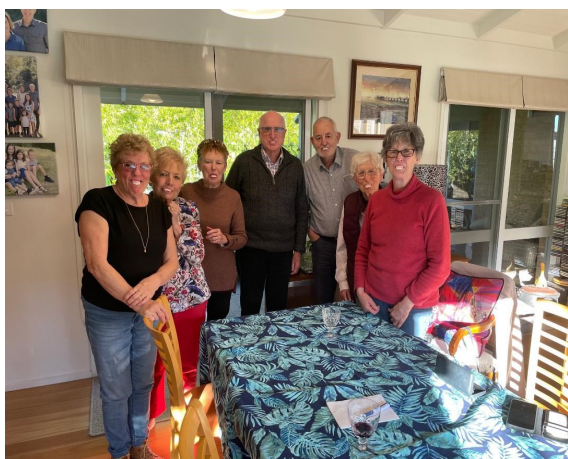
Strange things happen when you play Canasta!